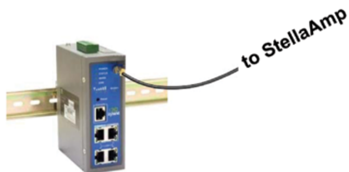
Connect to StellaAmp to get signal