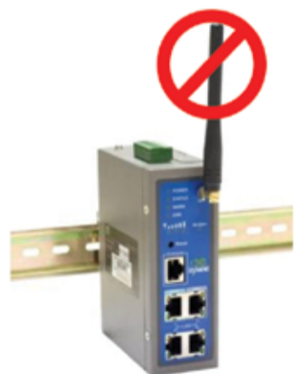
Antenna cannot receive a signal