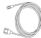
12m outdoor Cable